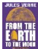
Sci-Fi Audio book