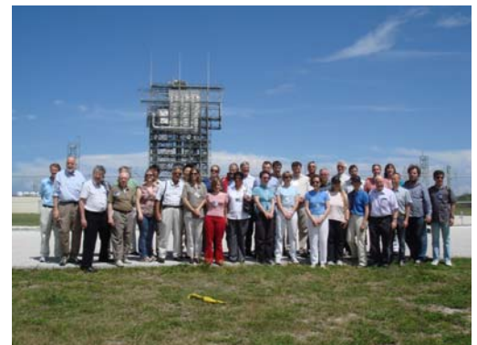
Science team at launch site