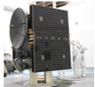
Spacecraft in stowed configuration