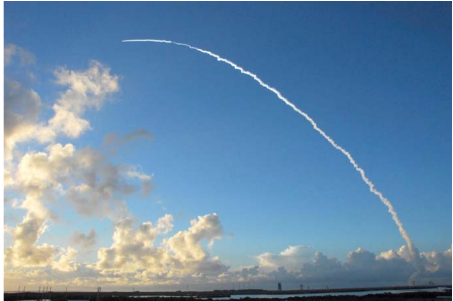
Launch of Dawn spacecraft from Cape Canaveral, Sept 27, 2007