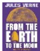
Sci-Fi Audio book